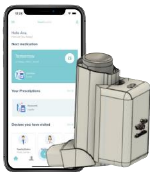
Figure 1 - eBreathie first prototype.